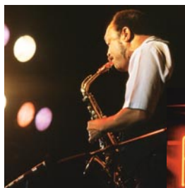
Live jazz can be heard nightly at clubs around town.

Explore the innovations that have the potential to rock the world of residential energy use in North America. What is coming down the pike that will transform the way our homes perform and meet our needs? How could these innovations affect the work that we do and impact our energy future, the environment, and the economy? This discussion will cover that gamut - from widgets to feedback systems.