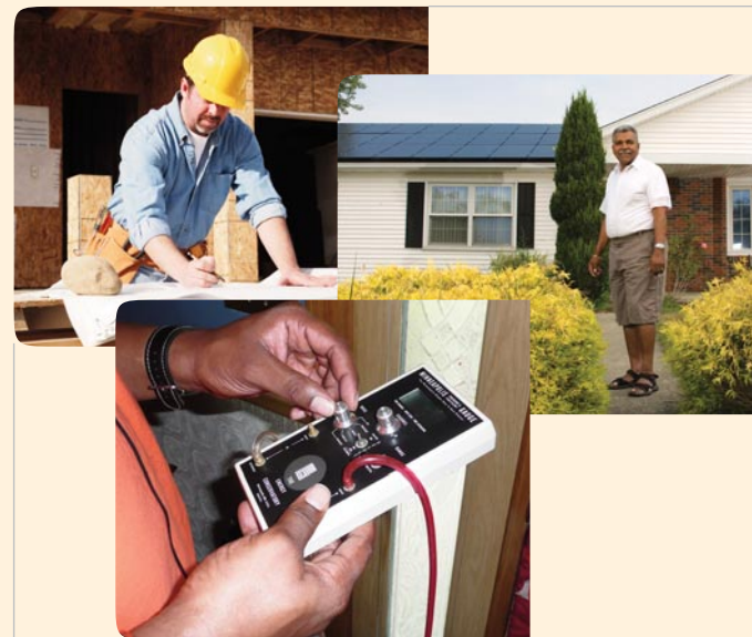
HOUSE AS A SYSTEM