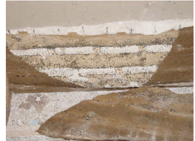
PHOTO 5 More mold on wall between kitchen and hall bathroom.