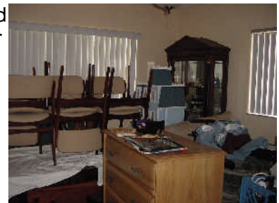
PHOTO 16 Note that during mold remediation the household items were never removed to a safe dry place for storage, nor were they left at the property and covered in protective plastic to prevent cross contamination.