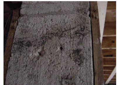
PHOTO 15 Mold on concrete near rear family room area.