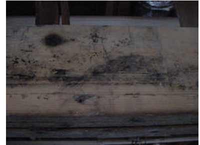
PHOTO 14 Mold on concrete near rear family room area.