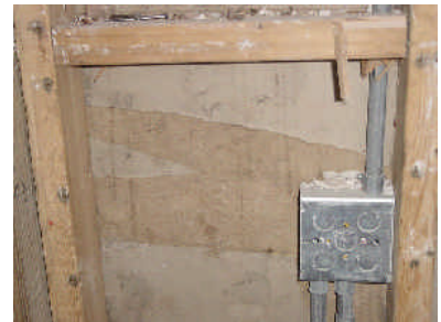
PHOTO 6 Mold and moisture stains on wall between kitchen and bathroom.