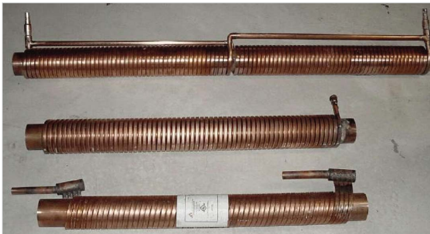
Figure 2 Three units from Phase I report. From top to bottom: ReTherm S3-60, GFX G3-40, PowerPipe R3-36.