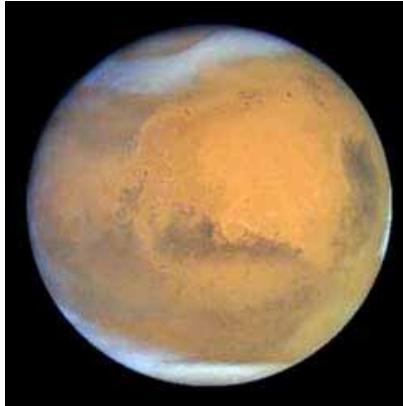
Not enough greenhouse effect: The planet Mars has a very thin atmosphere, nearly all carbon dioxide. Because of the low atmospheric pressure, and with little to no methane or water vapor to reinforce the weak greenhouse effect, Mars has a largely frozen surface that shows no evidence of life.

The industrial activities that our modern civilization depends upon have raised atmospheric carbon dioxide levels from 280 parts per million to 379 parts per million in the last 150 years. The panel also concluded there's a better than 90 percent probability that human-produced greenhouse gases such as carbon dioxide, methane and nitrous oxide have caused much of the observed increase in Earth's temperatures over the past 50 years.