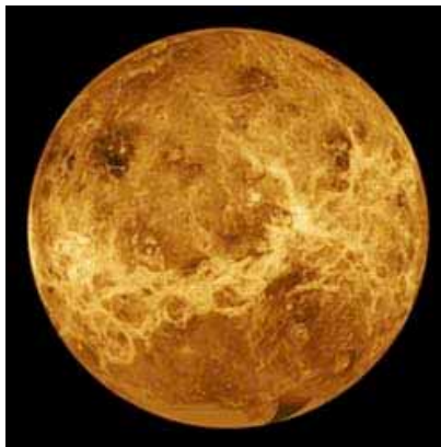
Too much greenhouse effect: The atmosphere of Venus, like Mars, is nearly all carbon dioxide. But Venus has about 300 times as much carbon dioxide in its atmosphere as Earth and Mars do, producing a runaway greenhouse effect and a surface temperature hot enough to melt lead.